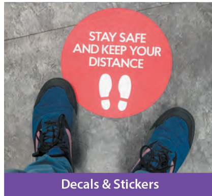
Decals & Stickers